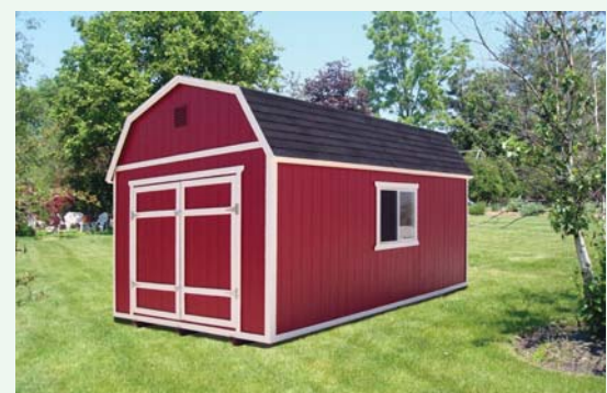
Shown with optional double door and window.

This shed is one of our most popular models. With standard 8' sidewall height (most of our competitors charge extra for this) and a classic barn profile that means a high ceiling and lots of storage volume. This model allows for the addition of storage lofts up high for added storage area without using up all that valuable floor space.