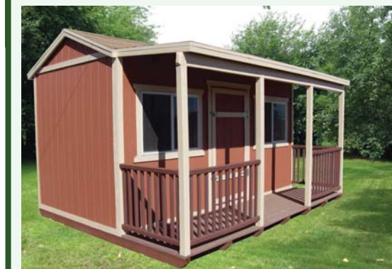
Shown with optional windows and porch rail.

A combination of our PEAK and PORCH models, this shed comes with a standard 5/12 roof pitch on the main section. The porch deck comes standard with 2 x 6 douglas fir but can be upgraded to composite decking for an additional fee.