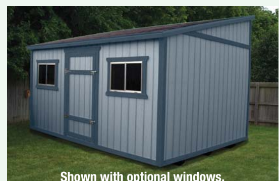
Shown with optional windows.

Lean-To sheds have the versatility to fit into tight spaces while remaining a great looking shed in its own right! The single direction sloped roof lends itself to narrow spaces such as your side yard while shedding water away from the house. The height and roof slope can be easily altered, as needed, to fit below eaves of your home or even mobile home awnings.