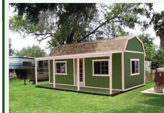
Shown with optional french door and windows.

The Barn Porch design is the result of customers needing the added storage space of a Tall Gambrel but also desiring the character of a porch shed. The result is a nice "rustic country" appearance and feel. The standard porch is 4 feet deep x the length of the shed although the depth can be increased.