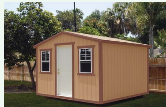
Shown with optional steel door and windows.

Our best selling shed, the Tall Peak has a contemporary design that fits well with most newer home designs. The center height is taller and varies depending on the width of the shed. This shed comes with a standard swing-out wood door 43" wide x 6'4" tall. Larger versions of this shed can be used as garages with a concrete slab floor.