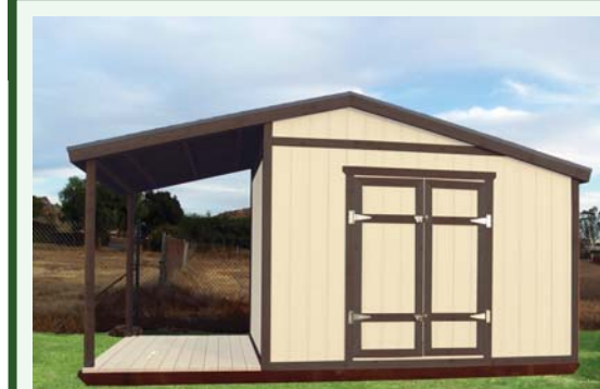
Shown with optional double door.

The Tack Shed is a variation of a Tall Peak shed design. We have increased the height of the sidewalls and converted part of one side into a covered storage porch to store hay and feed off the ground and protected from the rain. The size of the porch and shed sections can be changed to meet your particular storage needs. Use the inside to store saddles, tack, tools, or as a work area.